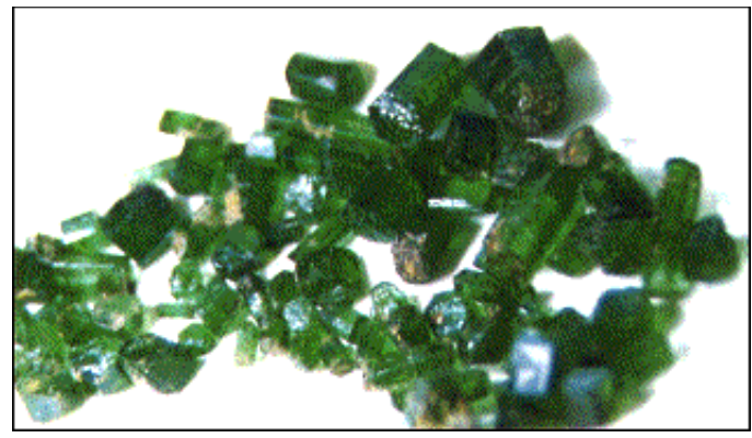
Figure 2. This parcel of 87 Afghan emeralds weighs a total of 140.9 ct and displays the range of colors found in the Panjsher material. Stones courtesy of Gem Industries, Inc.